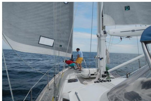
Sailing wing and wing, looking for dolphins

They purchased a new alternator and repaired the old one just in case. After that, the crew started to disintegrate as the schedule did not allow everyone to complete the Bermuda crossing and back. Instead, with the remaining crew, the decision was made to sail around Block Island, through Buzzard Bay, to Provincetown and finally back to Manchester.