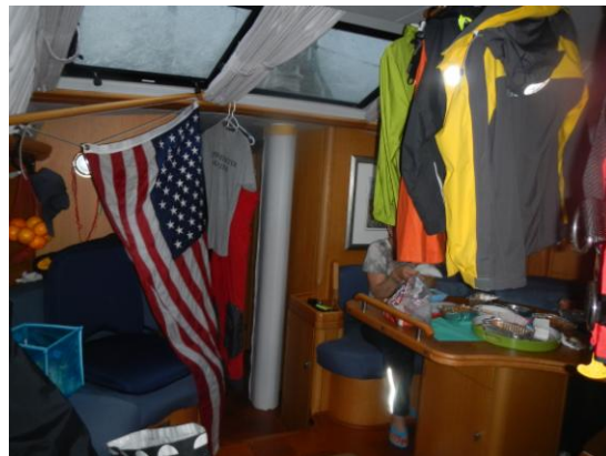
Drying off after the storm

"However, at the dock, even if we were exhausted, we decided it was time to celebrate with a little Bermuda rum."