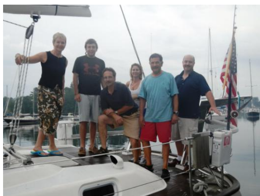
Crew at departure from Manchester Harbor