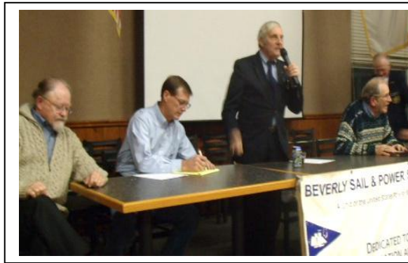
The Meeting Has Been Called to Order – January, 2013