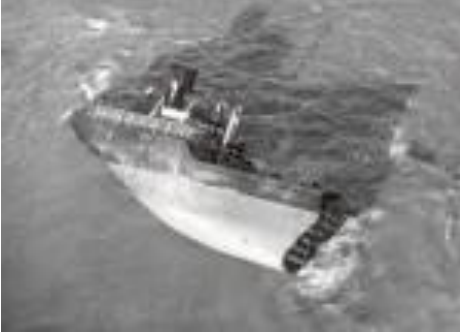
Stern section of the "SS Pendleton"