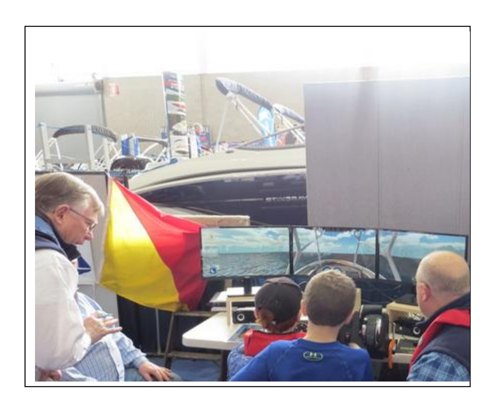
The New Boating Skills Virtual Trainer Was a Hit With Families