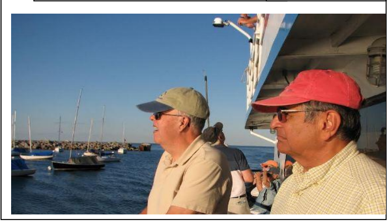
Entering Rockport Harbor