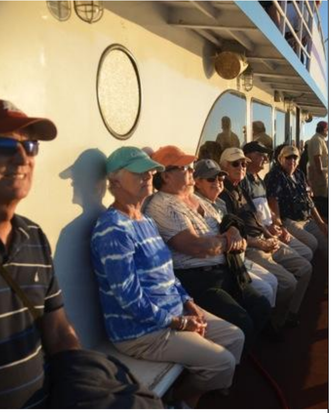
A Perfect Evening on the Yankee Clipper