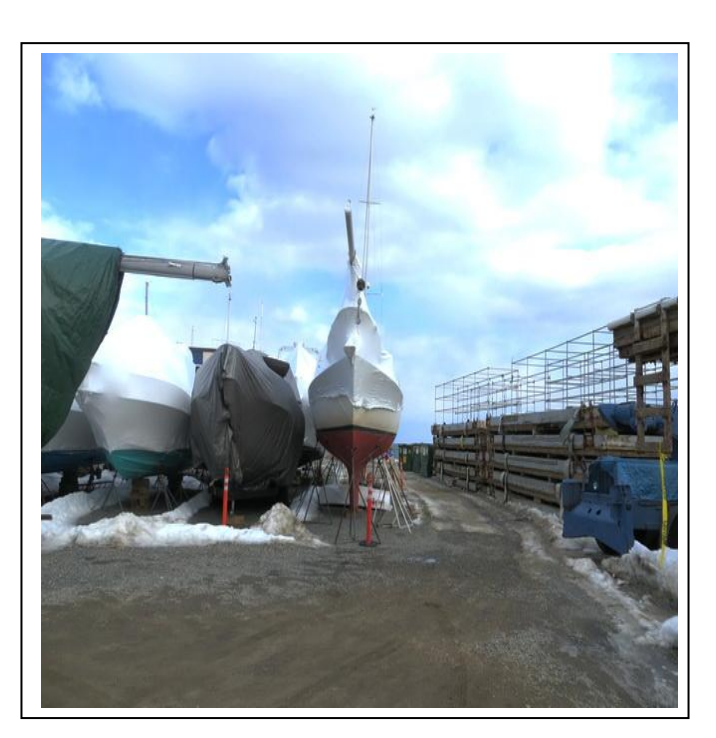
Winter at Jubilee Yacht Club

If you have an aluminum boat, it is important to check the ingredients of the bottom paint that you plan to use. The combination of copper and aluminum produces an electrolytic reaction that can compromise the aluminum hull. I recently saw an aluminum boat that was severely corroded due the use of improper bottom paint.