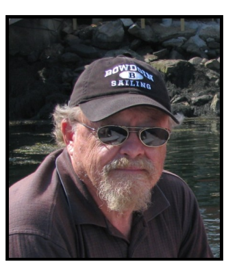
From the Executive Officer