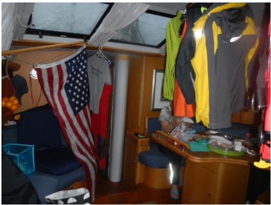
Drying off after the storm

"However, at the dock, even if we were exhausted, we decided it was time to celebrate with a little Bermuda rum."