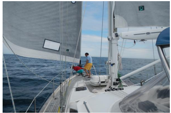
Sailing wing and wing, looking for dolphins

They purchased a new alternator and repaired the old one just in case. After that, the crew started to disintegrate as the schedule did not allow everyone to complete the Bermuda crossing and back. Instead, with the remaining crew, the decision was made to sail around Block Island, through Buzzard Bay, to Provincetown and finally back to Manchester.