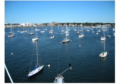
View of Salem Harbor from aloft Night Music's mast