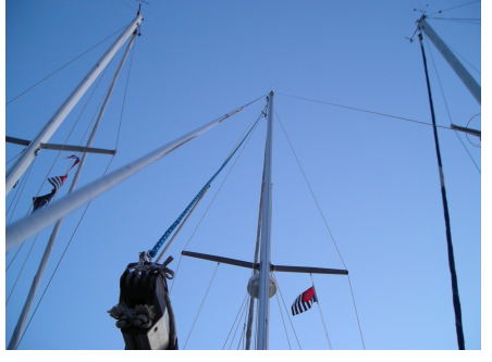
Burgees and ensigns from the deck